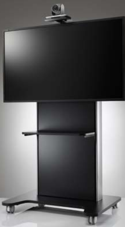
Single screen set up with VC kit and shelf