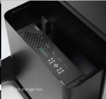
Front storage box