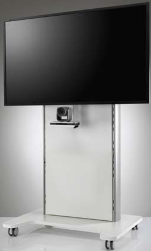
Single screen set up with VC kit