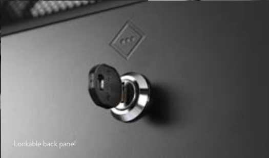
Lockable back panel