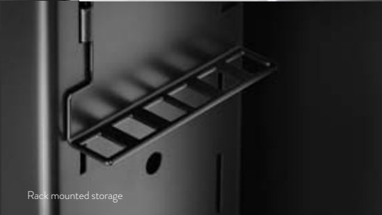
Rack mounted storage